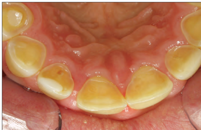
Fig. 4. Severe oral erosion. Note the composite filling rising above the adjacent tooth surface. Age of patient: 25 years. Known etiological factors: regurgitation, on average seven acidic intakes per day (same patient as in Fig. 1).