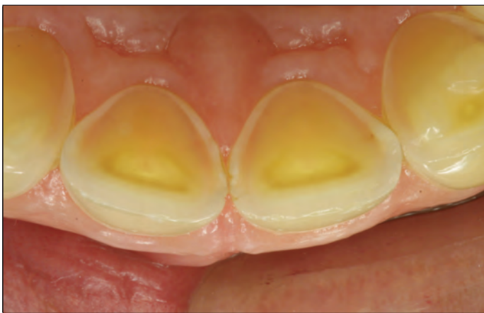
Fig. 3. Severe oral erosive tooth wear. Note the intact enamel along the gingival margin. Age of patient: 28 years. Known etiological factor: vomiting over years.