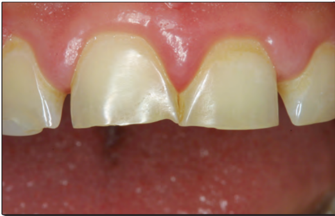
Fig. 1. Severe facial erosive tooth wear. Age of patient: 25 years. Known etiological factors: regurgitation, on average seven acidic intakes per day.