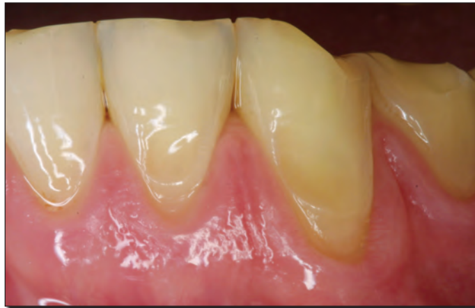
Fig. 2. Facial erosive tooth wear. Age of patient: 29 years. Note the location of the defect. Known etiological factor: gastroesophageal reflux.