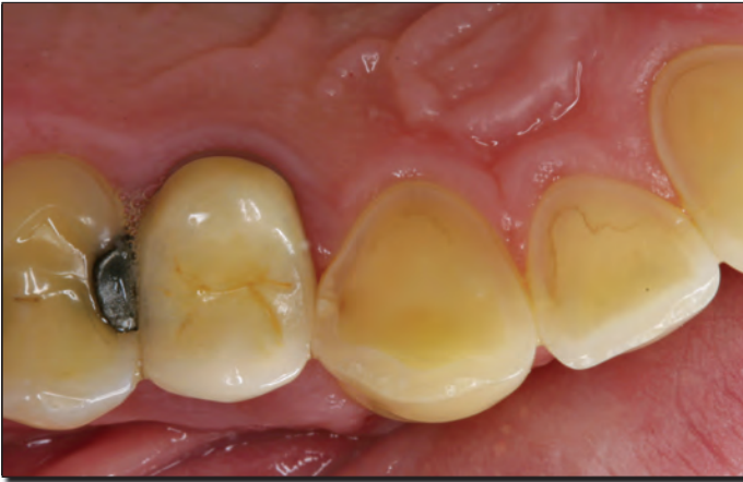
Fig. 7. Severe oral and occlusal erosive tooth wear. Note the approximal caries lesion on the canine. Age of patient: 29 years. Known etiological factor: gastroesophageal reflux (same patient as in Fig. 2).

involvement visible. In later stages, it is sometimes difficult to distinguish between the influences of erosion, attrition or abrasion during a clinical examination. Indeed, these conditions may occur simultaneously. Tooth surfaces of patients with active (unstained) erosion have no caries. However, at sites where plaque accumulation is possible (e.g. approximal), caries may also occur in patients with erosion (Fig. 7). The most commonly reported areas with wear are occlusal surfaces. These surfaces are also associated with attrition and abrasion, and it can be difficult to separate what is being caused by erosion from what is being caused by other tooth wear factors. 11 Therefore, a modern preventive strategy suggests training of dentists in early detection and monitoring of the process is needed.