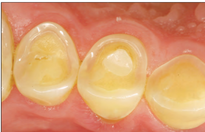
Fig. 5. Severe oral and occlusal erosive tooth wear. Note the worn cusps and the composite filling rising above the level of the adjacent tooth surface. Age of patient: 25 years. Known etiological factors: regurgitation, on average seven acidic intakes per day (same patient as in Fig. 1).