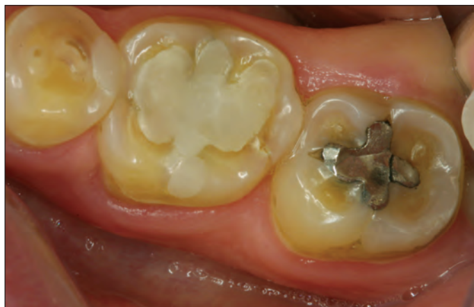
Fig. 6. Severe occlusal erosive tooth wear. Note the composite and amalgam fillings rising above the level of the adjacent tooth surface. Age of patient: 25 years. Known etiological factors: regurgitation, on average seven acidic intakes per day (same patient as in Fig. 1).

margin, with cupping and grooving on occlusal surfaces are some typical signs of enamel erosion. It has been hypothesized that the preserved enamel band along the oral and facial gingival margin could be due to some plaque remnants, which could act as a diffusion barrier for acids. This phenomenon could also be due to an acid neutralizing effect of the sulcular fluid. 9 In the more advanced stages, further changes in the morphology can be found. These changes result in further